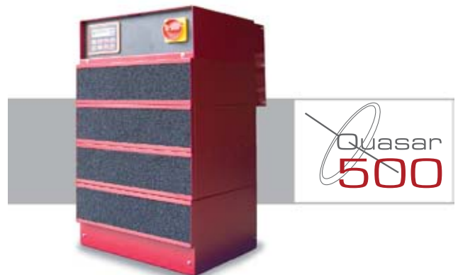
16V/1000A(3000A) PPR air cooled, 400VAC