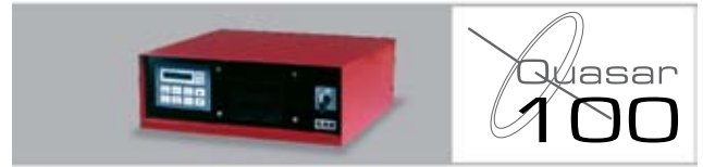
16V/300A(600A) PP mini air cooled, 400VAC

These rectifiers, via software, are able to handle a current pattern of up to 6 phases (more phases on request).