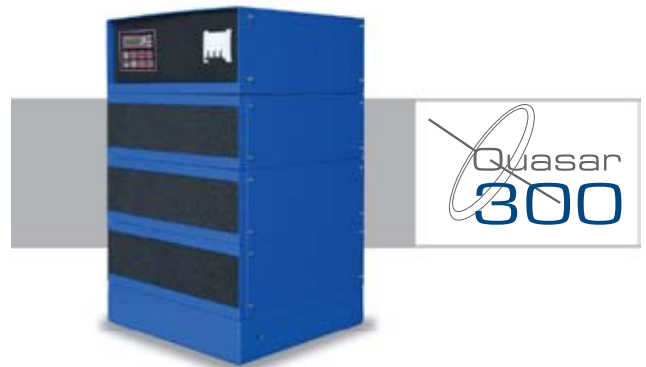
16V/1000A(2000A) PP air cooled, 400VAC